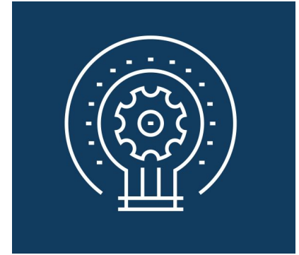
Innovation, Creativity, Entrepreneurship